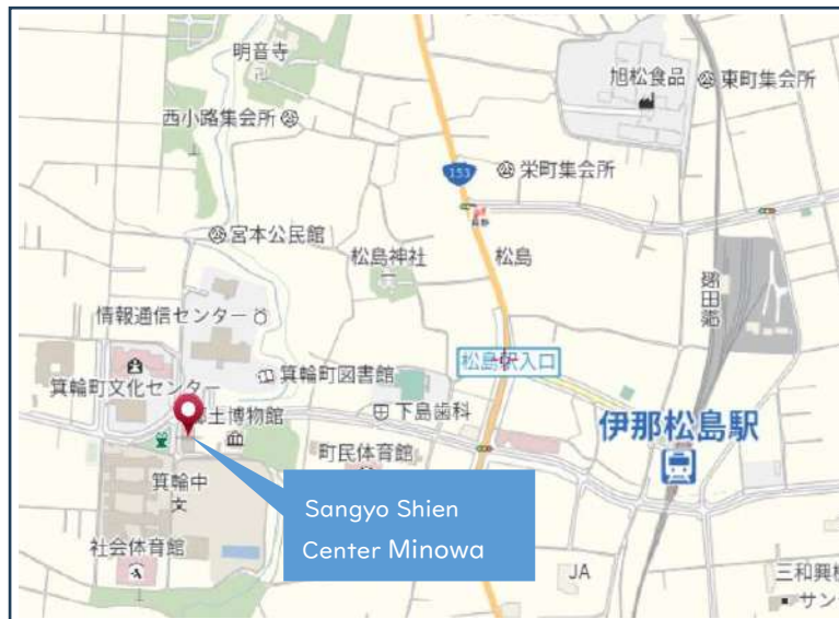
8/25 Minowa Area Venue: Sangyo Shien Center Minowa 10298 Naka-Minowa, Minowa Machi